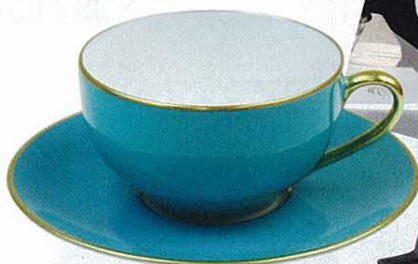
Limoges teacup and saucer set, $118.50, from T2, www.t2tea.com.