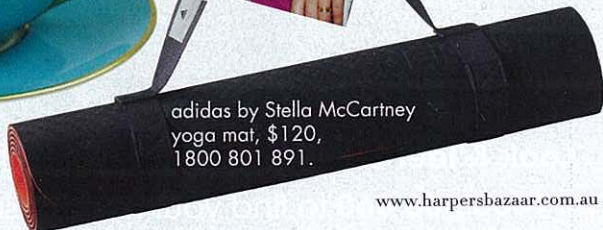
adidas by Stella McCartney yoga mat, $120, 1800 801 891.