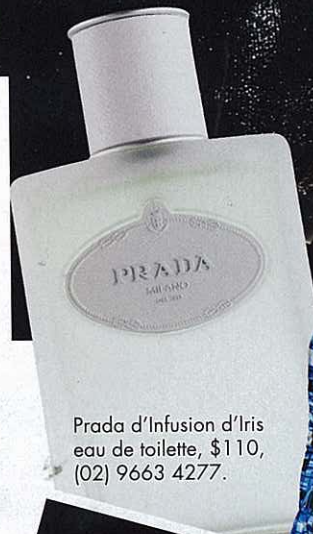
Prada d'Infusion d'Iris eau de toilette, $110, (02) 9663 4277.

"We just bought an amazing painting by Gary Hume; it's my new favourite artwork. It's very special."