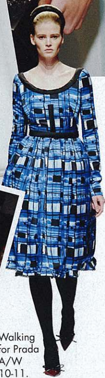
Walking for Prada A/W 10-11.