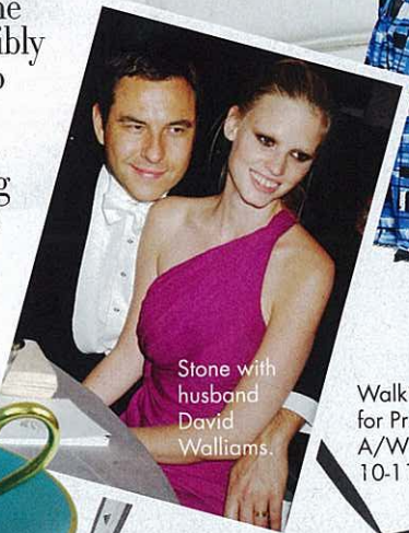
Stone with husband David Walliams.